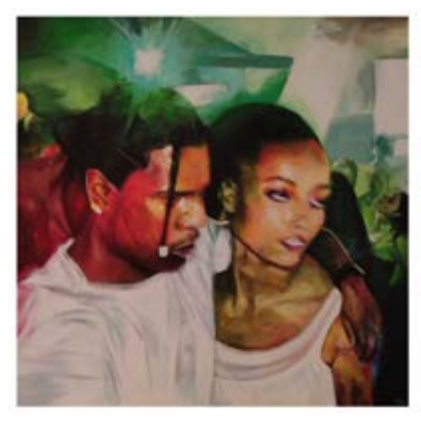
«Sundress» by Joséphine Caron that won 1st prize of the U-Art festival 2024

Carnot Campus: Building L - Level -1 Alpes Europe Campus: Student space